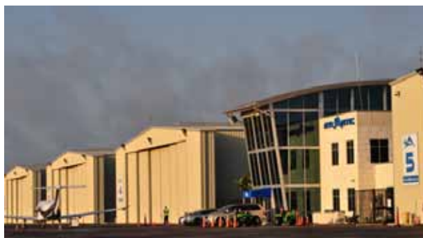
Atlantic Aviation operates the largest network of fixed base operations (FBOs) within the United States.

Across its nationwide network of 65 fixed based operations (FBOs), the company had installed legacy Wi-Fi equipment using standard reference designs and omni-directional antenna systems that simply couldn't keep up with an increasing number of concurrent wireless connections and RF interference, which only exacerbated flaky Wi-Fi connectivity. At many of these FBOs, broadband circuits were unavailable, so the legacy Wi-Fi system integrated support for cellular data services (3G) to backhaul traffic. But as traffic, clients, devices, and interference increased — this model didn't scale.